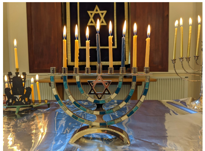
Our community Chanukiah from our special Chanukah Service this month.