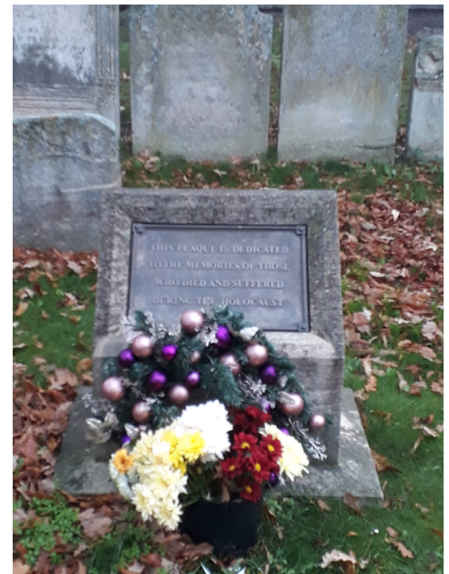
A picture from Stamford recently where someone has been continuing to pay their respects.

There will also be a Commemoration on Youtube that can be viewed from 11.00am on 27 January 2022. The link will be available nearer the time.